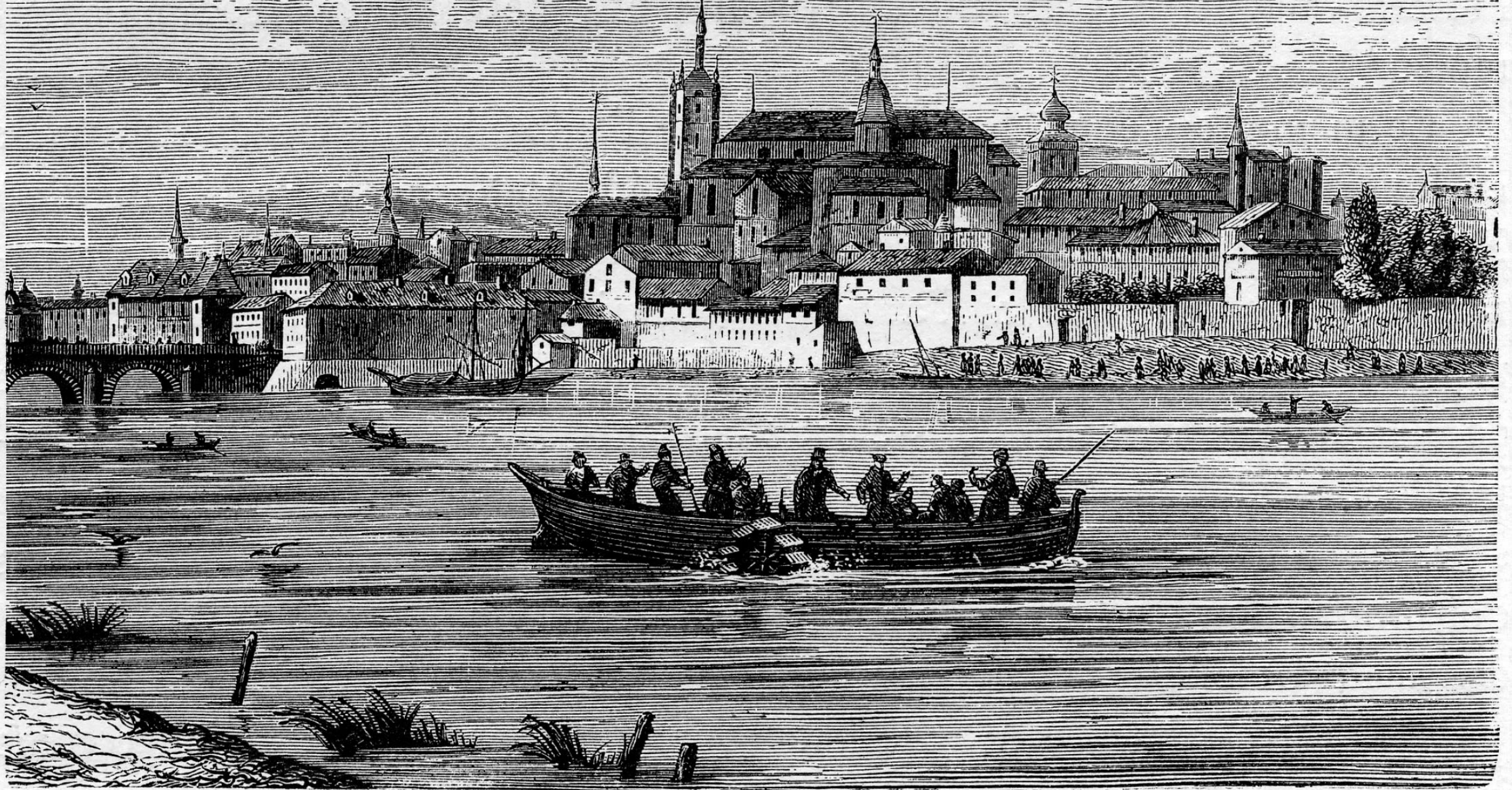
Expériences de M. de Jacobi sur la Néva (1839).