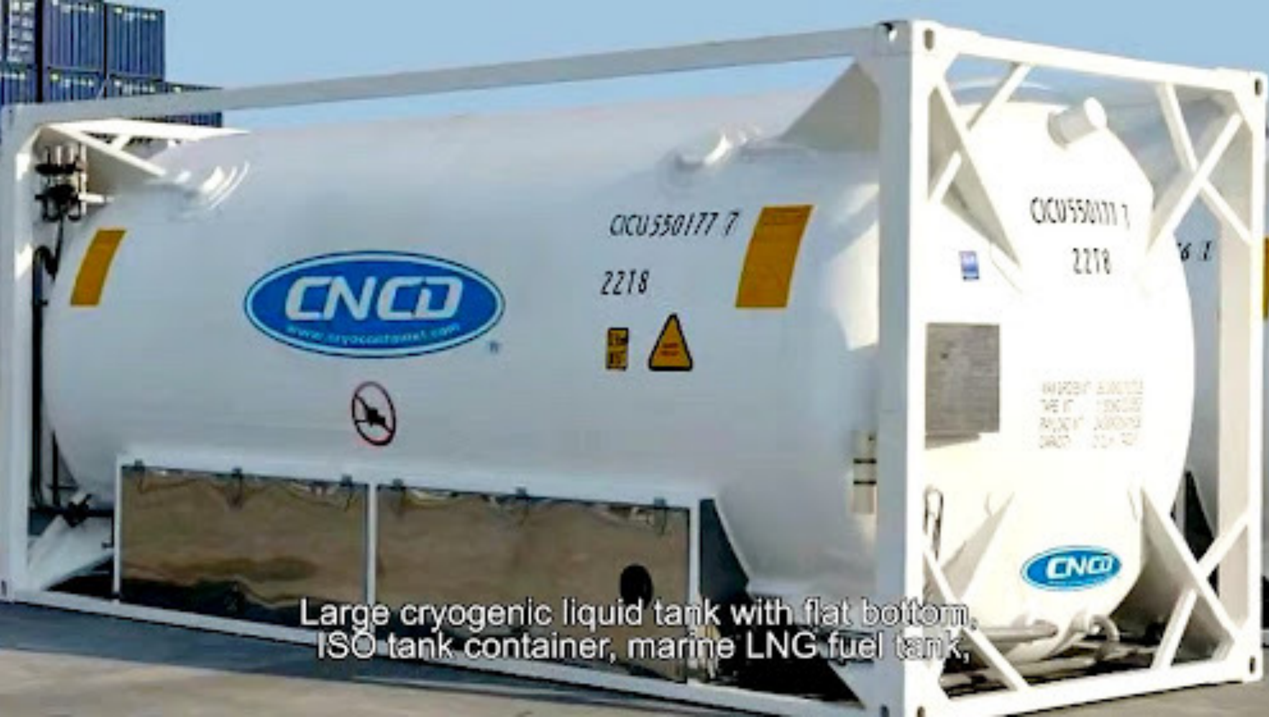
Large cryogenic liquid tank with flat bottom, ISO tank container, marine LNG fuel tank,